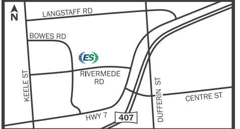
401 BOWES ROAD